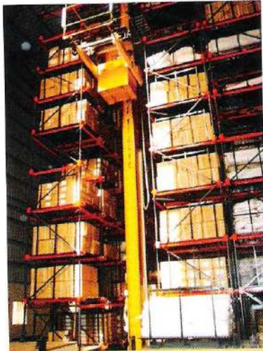
High Rise Racking