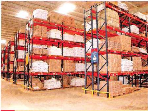
FMCG Distribution Centre