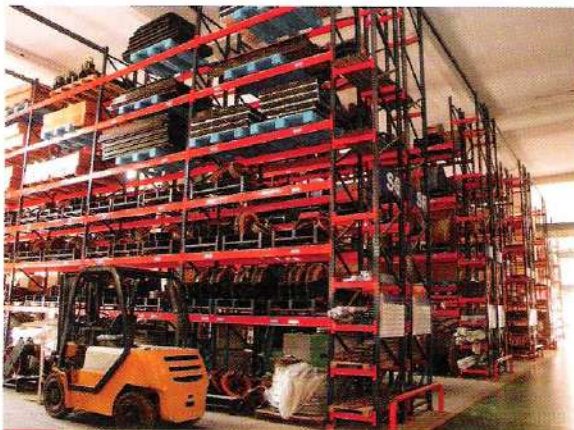
Engineering Raw Material Store