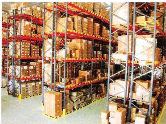
Consumer durable finished goods Store

Selective Pallet Racking is the simplest and the most economical racking system which allows 100% accessibility to each pallet. This is ideal for large variety SKUs which need individual traceability and handling. This enables flexibility of managing variety of items yet fast throughput, as selective accessibility does not need any other pallet to be disturbed for storing and retrieving a particular pallet.