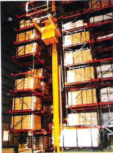
High Rise Racking